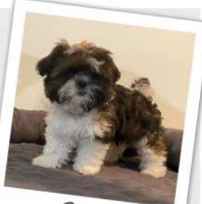
Boni Born 3.4.25 | Shih Tzu | Female