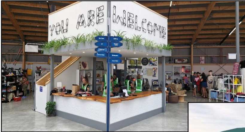
The new Rolleston recycle shed at their refuse site

I would also like to thank all members who participated, for the camaraderie during the event.