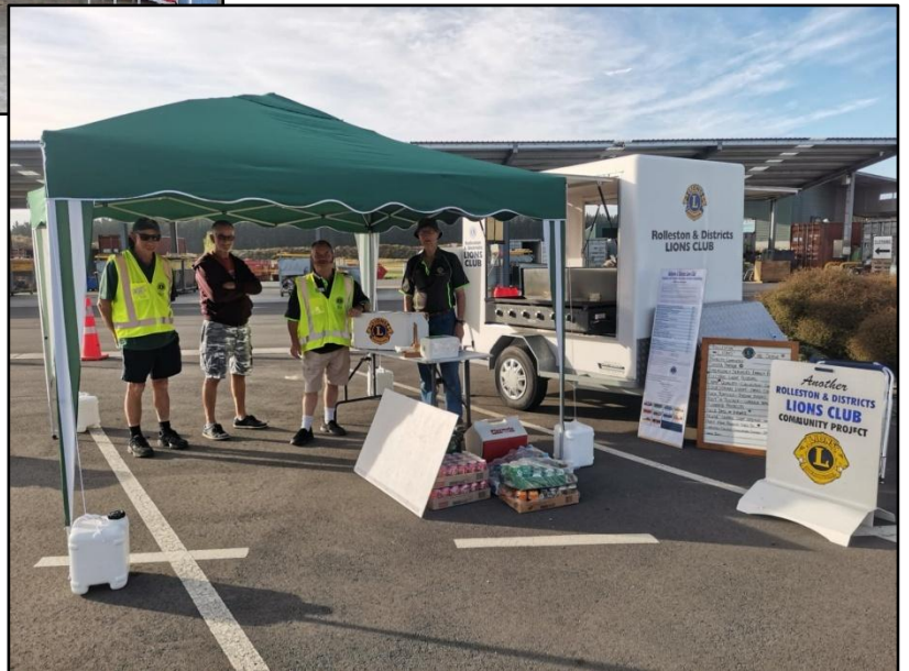
Our Club cooking up a storm at The Rolleston Recycle Shed Day