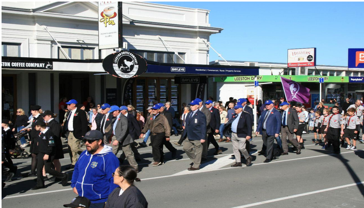
Ellesmere Lions on Anzac Day.