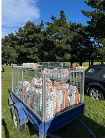
The Team collecting Horse Manure from Mini Haha