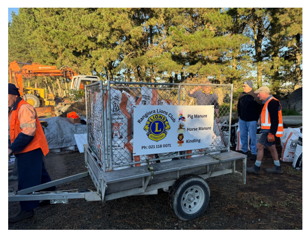
The Saturday delivery Team is loading up and ready to "Spread" the good word.