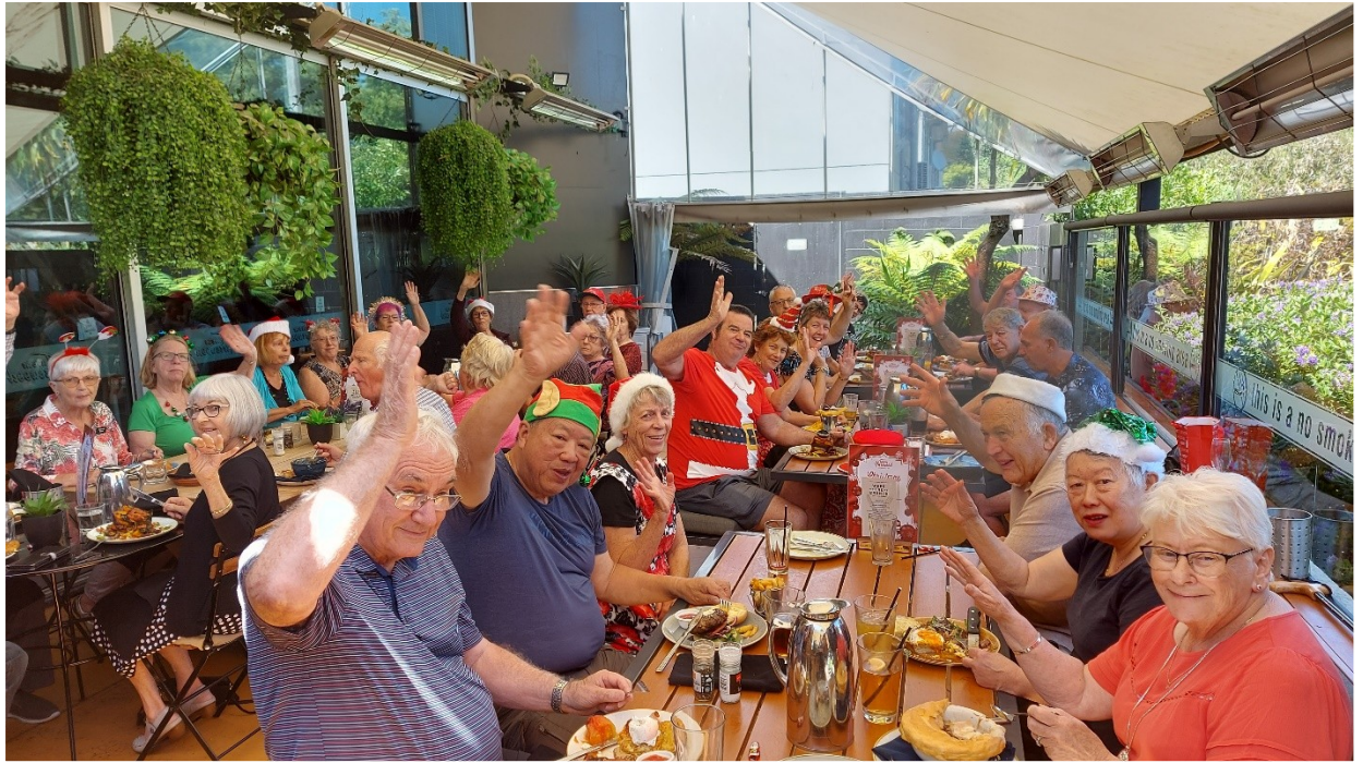
Our Xmas brunch at Harewood tavern 7th December