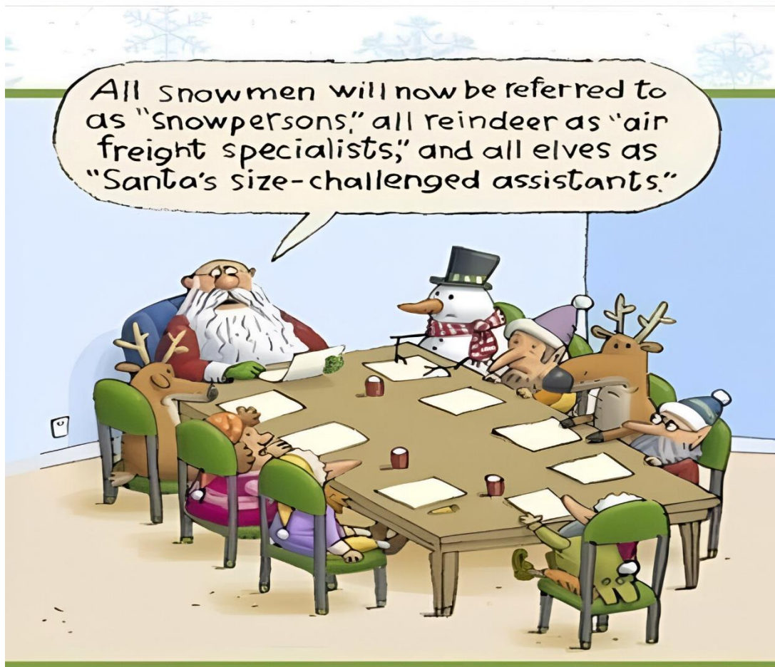
The Year Santa Hired a Consultant