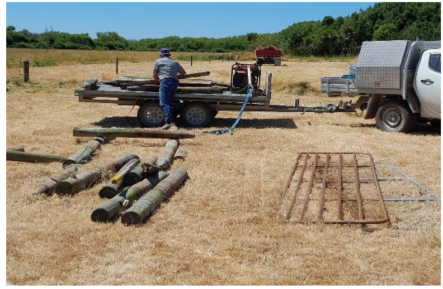
The fence was then removed and a temporary fence constructed 25mtrs out into the paddock