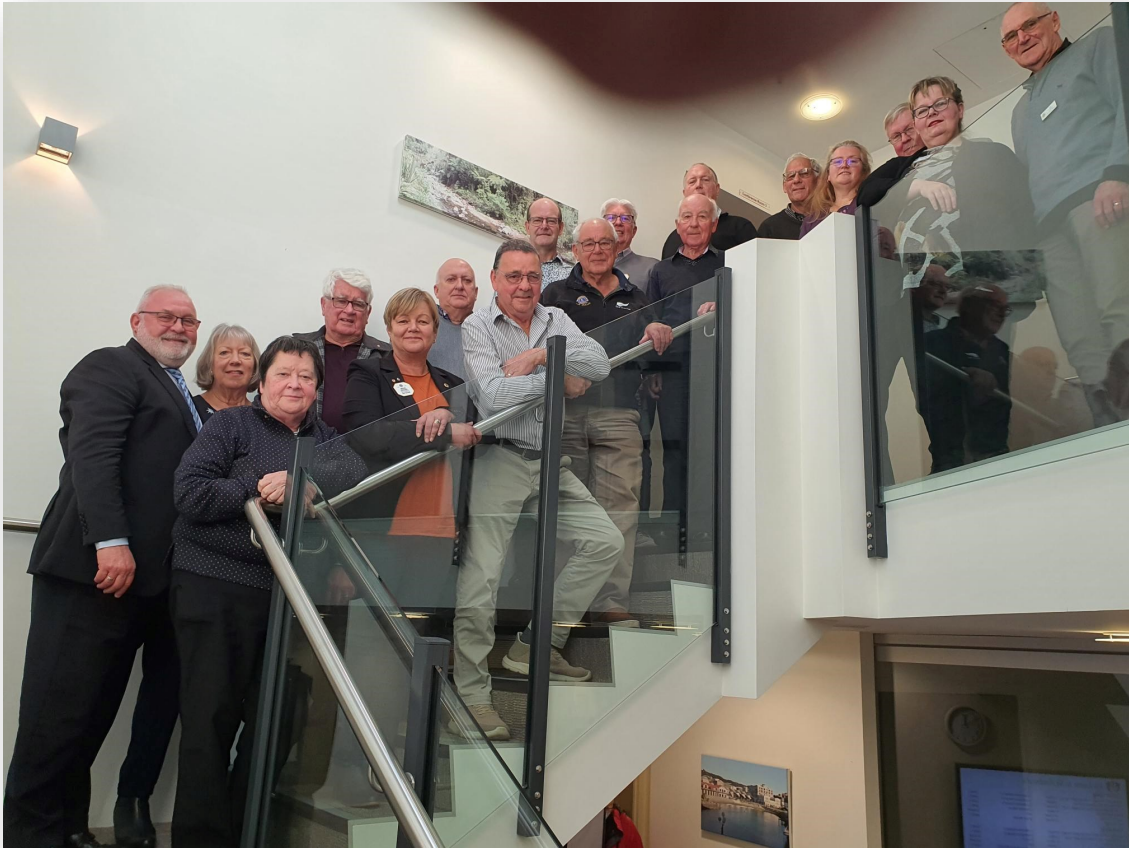
The Lloyd Morgan Lions Club Charitable Trust team.