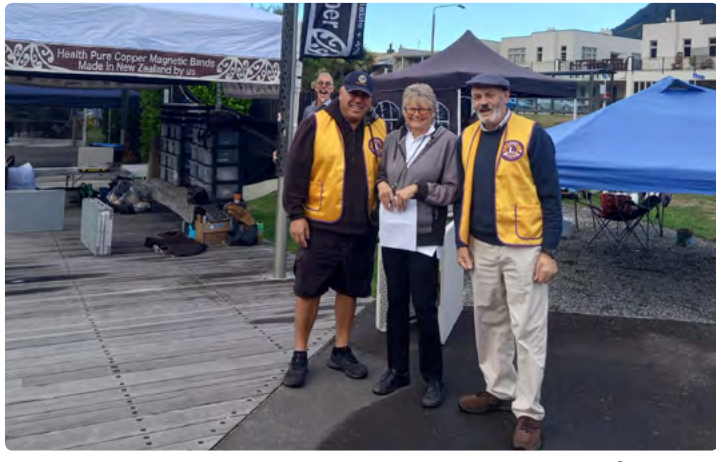
Picton Lions were out and about with yet another Cruise ship market Friday and Saturday. Grateful to those who pitched in. When they are short of helpers they Just Ask!