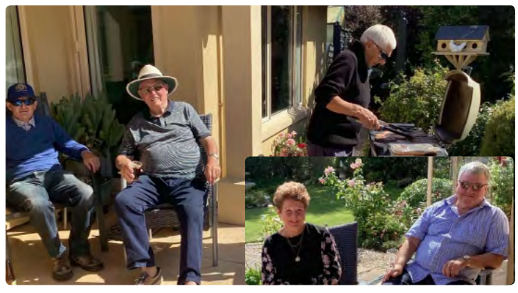
Christchurch South Lions recognise the importance of social get togethers, as here at their recent BBQ.