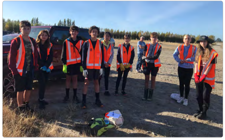
Rangiora High School Leos joined the Ashley Rakahuri Care Group with their mission to create weed free riverbeds in the braided Ashley River for mostly endangered bird species.