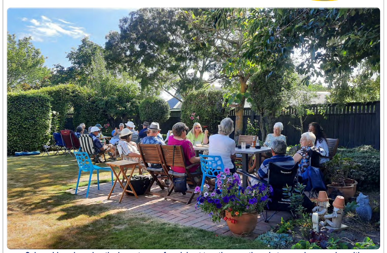
Selwyn Lions knowing the importance of social get togethers, gathered at a members garden with fellow Lions, partners and potential members.