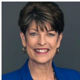
President's Message Changing the World with International President Dr. Patti Hill

As of 2020, they estimated that there are approximately 13,420 people with Down syndrome in Australia and 3,065 people with Down syndrome living in New Zealand.