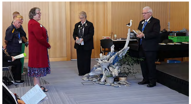
left - Lions rededication to service. right - Listening to valedictory.