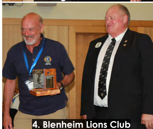
4. Blenheim Lions Club