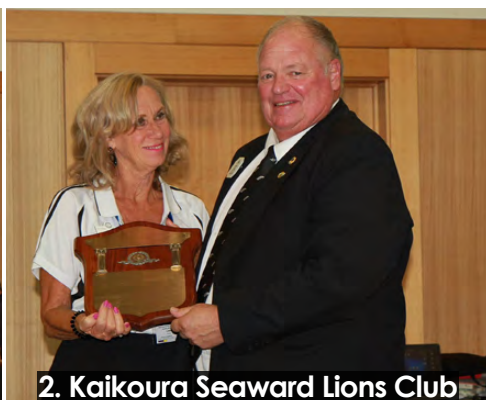
2. Kaikoura Seaward Lions Club