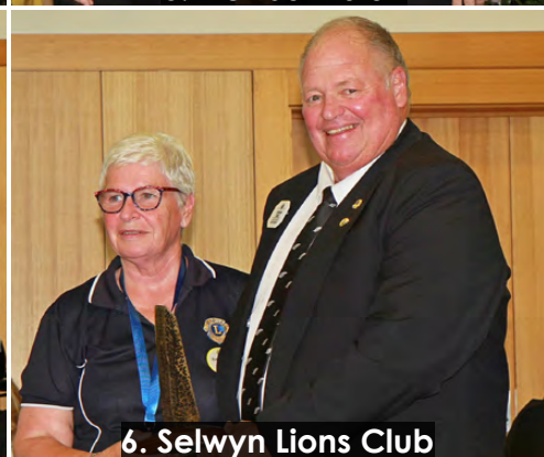
6. Selwyn Lions Club