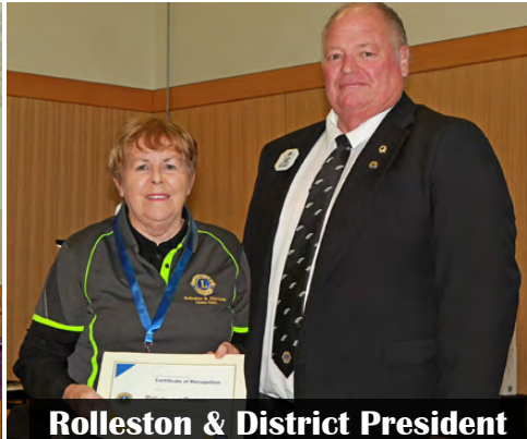
Rolleston & District President