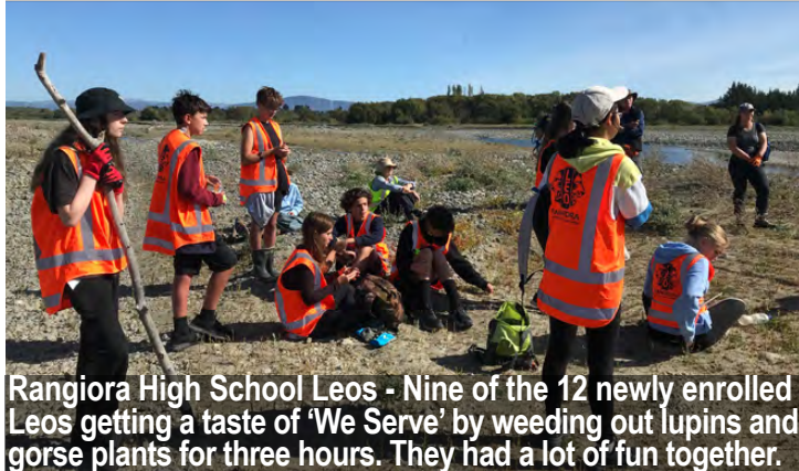
Rangiora High School Leos - Nine of the 12 newly enrolled Leos getting a taste of 'We Serve' by weeding out lupins and gorse plants for three hours. They had a lot of fun together.