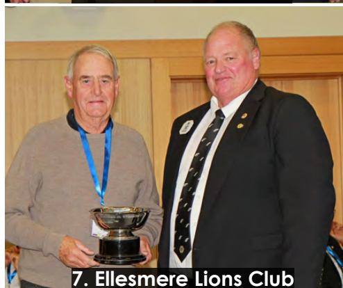
7. Ellesmere Lions Club