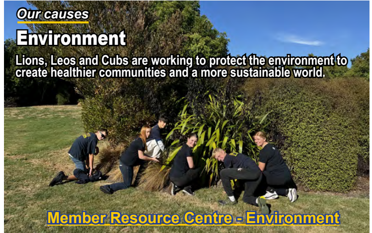
Member Resource Centre - Environment

Lions, Leos and Cubs are working to protect the environment to create healthier communities and a more sustainable world.