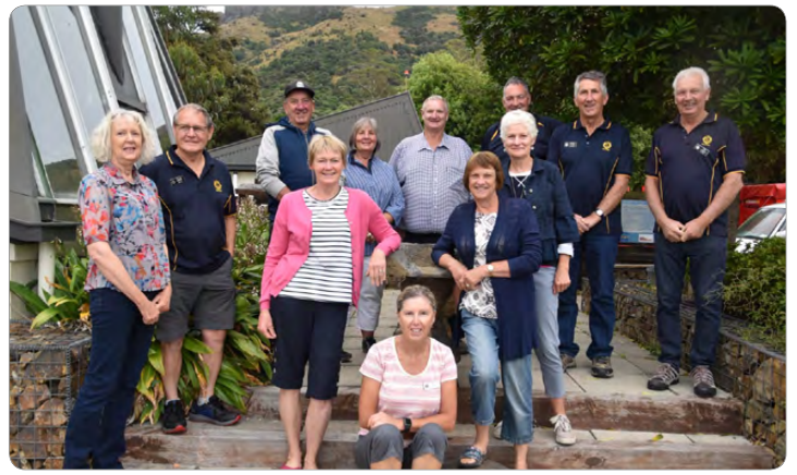
Catering Teams at Camp Quality 2024 above Malvern middle Christchurch Ferrymead and bottom Selwyn Lions.