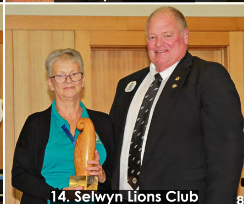
14. Selwyn Lions Club