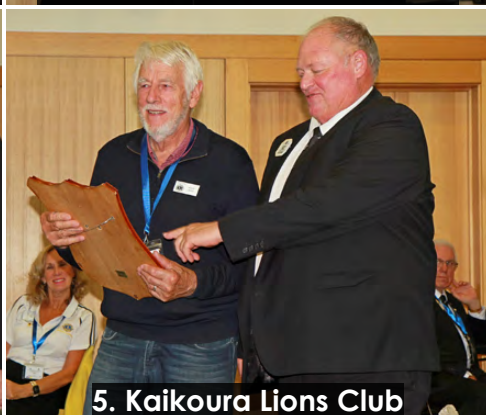
5. Kaikoura Lions Club