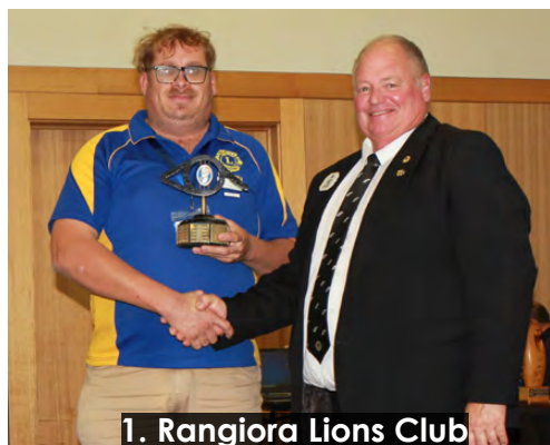
1. Rangiora Lions Club