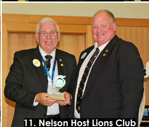
11. Nelson Host Lions Club