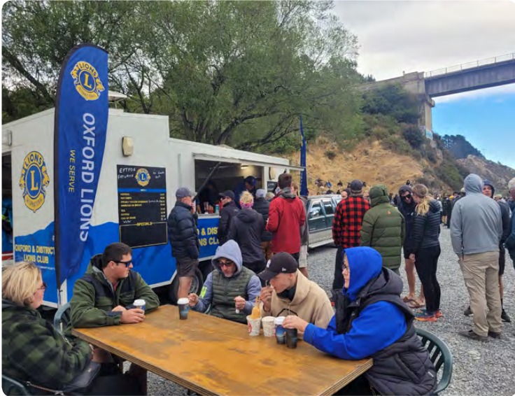
Oxford & District Lions feeding the masses at this year's Coast to Coast race and flying their 'Lions banners' to ensure everyone know that they are Lions.