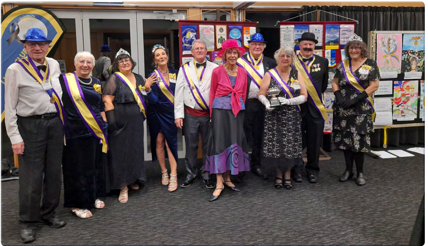
Lucas Trophy - Best Presented Club at Convention Social - New Brighton Lions Club. (What an amazing array of outfits - all fit for any Captain's Table. 202E Convention 2024)