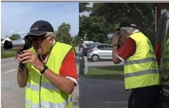
A 74-year-old man uses his hair dryer to slow traffic near his home

You're funny. You don't always let your humour shine through, but anyone who knows you well is totally aware that you can make people collapse in laughter. Your wry sense of humour and sharp observation skills can't be beat.