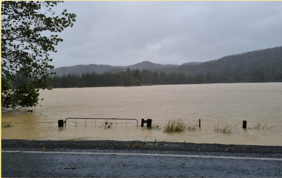
Ruawai / Dargaville Flood Ravaged Area

Kaipara District Northland Cyclone Gabrielle Devastation