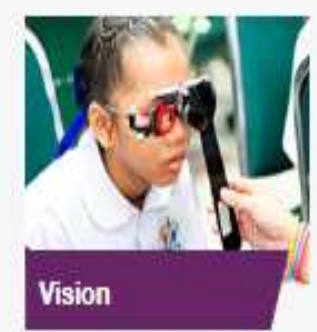
LCIF helps Lions prevent avoidable blindness and care for the visually impaired.

Our mission is to empower Lions clubs, volunteers, and partners to improve health and well-being, strengthen communities, and support those in need through humanitarian services and grants that impact lives globally, and encourage peace and international understanding.