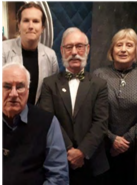
Christchurch City Lions - the four who were the chefs for a meal for Ronald McDonald House guests.