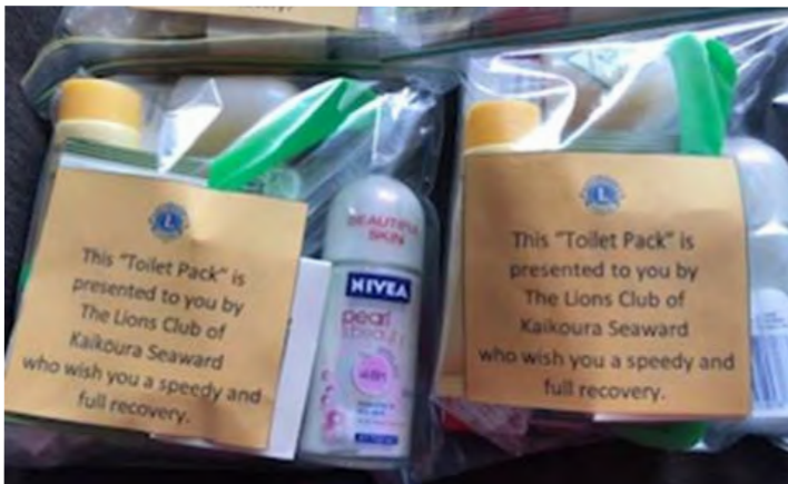
Kaikoura Seaward delivered 12 "Toilet Packs" to our local hospital.