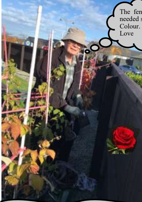
The fence needed some Colour. Art I Love