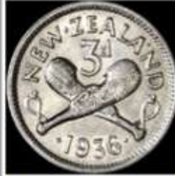
New Zealand threepence