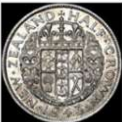
New Zealand half crown