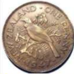
New Zealand penny.