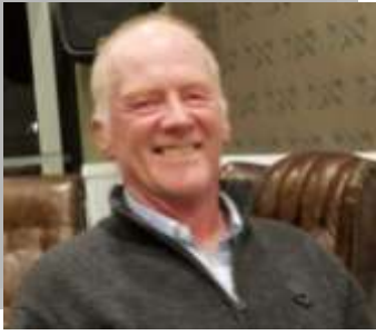
3rd VP Cans Coordinator 202E Zone 5 Chairperson

Every first Saturday of the month 9.30-11am, Lions are at Rangiora Council car park near Victoria Park not only doing Cash for Cans as a fundraiser, but also collecting wine bottle tops for Kidney Kids NZ. Bring along all your aluminium cans and wine bottle tops on Saturday 2nd October. Help us to serve our community!