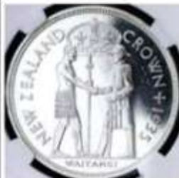
New Zealand crown