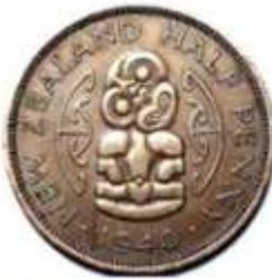
New Zealand halfpenny.

If you have any old coins (or current ones) please bring them along and put them in the HU4K container that will be on view at tea meetings from now on.