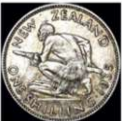
New Zealand shilling

Old NZ Coins Old Decimal Current coins Or Foreign into The tin at Lions tea Meeting