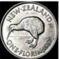
New Zealand florin