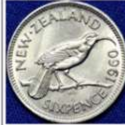
New Zealand sixpence