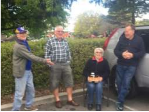
Every first Saturday of the month 9.30-11am, Lions are at Rangiora Council car park near Victoria Park not only doing Cash for Cans as a fundraiser, but also collecting wine bottle tops for Kidney Kids NZ. Bring along all your aluminium cans and wine bottle tops on Saturday 7th August. Help us to serve our community!