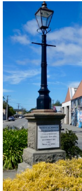
Out and About in Amberley

Board Meeting: The next board meeting will be held Monday 19th April 7.30pm in the Ravensdown staffroom.