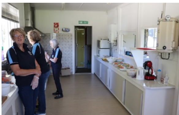
Lunch is served. Thanks catering team.