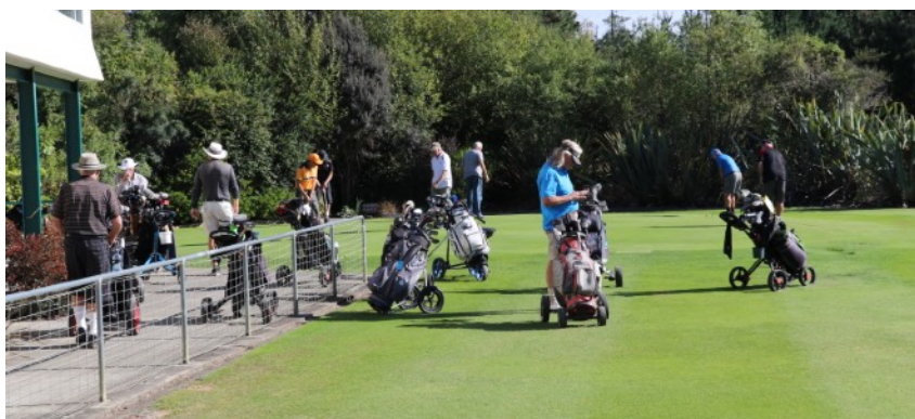
Golfers gathering at the Clubhouse