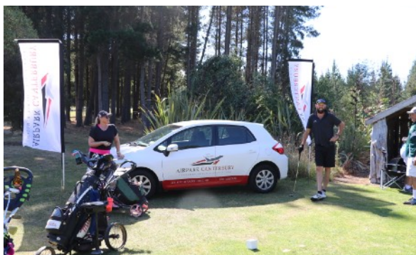
At No.10 . Shame it wasn't a hole in one prize !