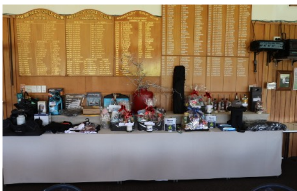
Prizes and vouchers donated