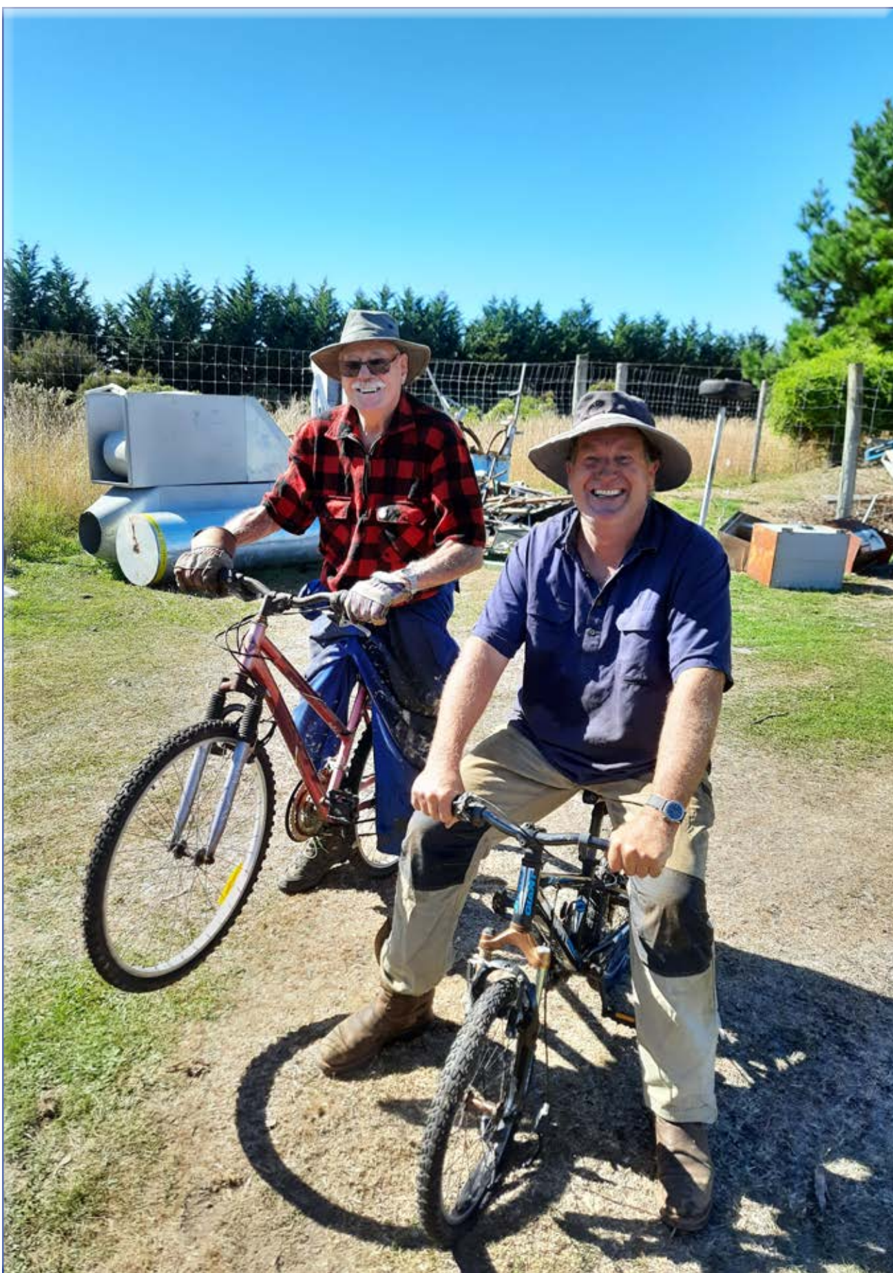
Two Lions told us they were at a Scrap metal working bee