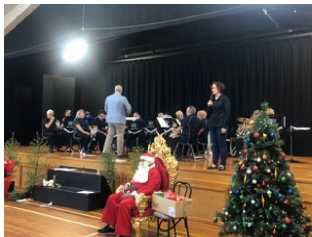
Rangiora Brass Band leading the carols