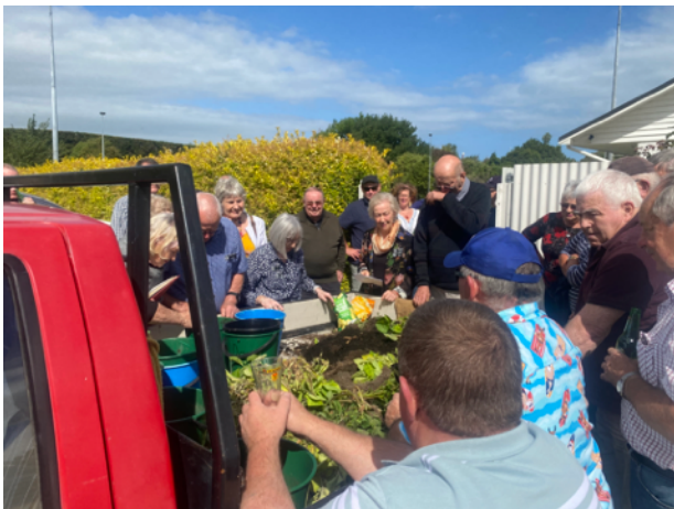
Spud in the Bucket judging.