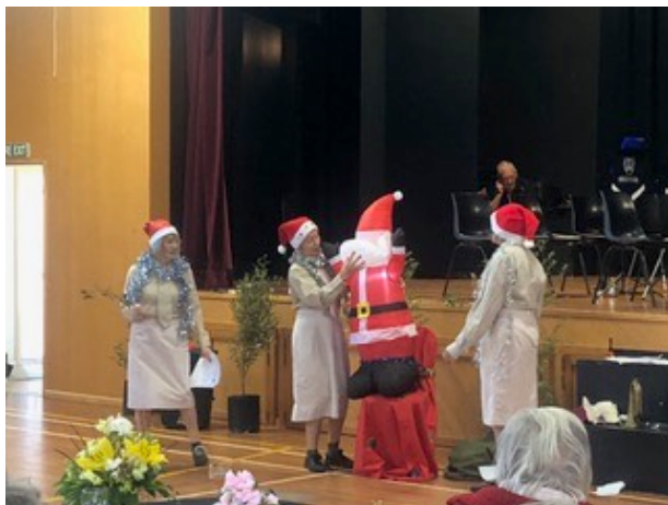
The D Day Darlings leading the sing along