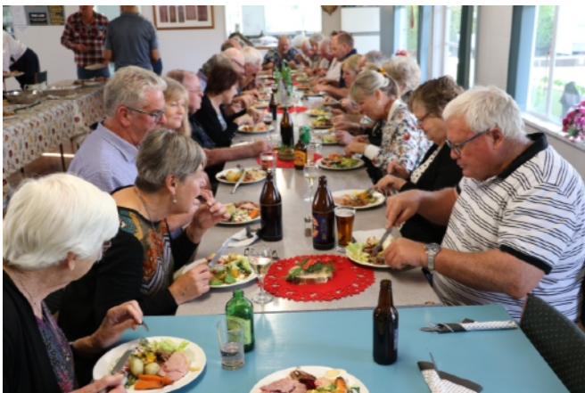
Tucking into festive fare