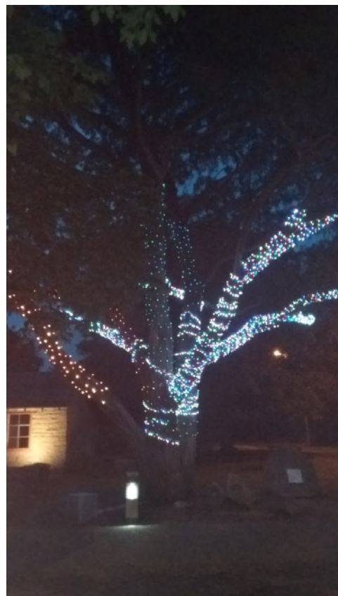
Out and about in Amberley Chamberlain Park Festive Lights