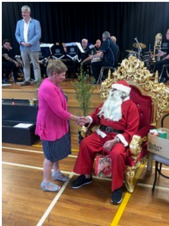
Santa presenting the raffle prizes