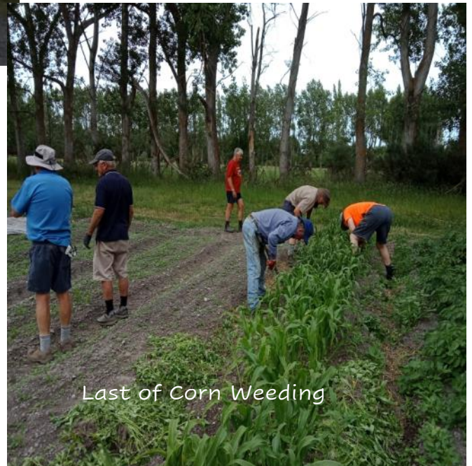
Last of Corn Weeding