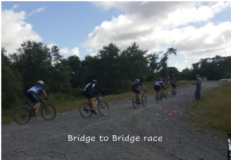
Bridge to Bridge race