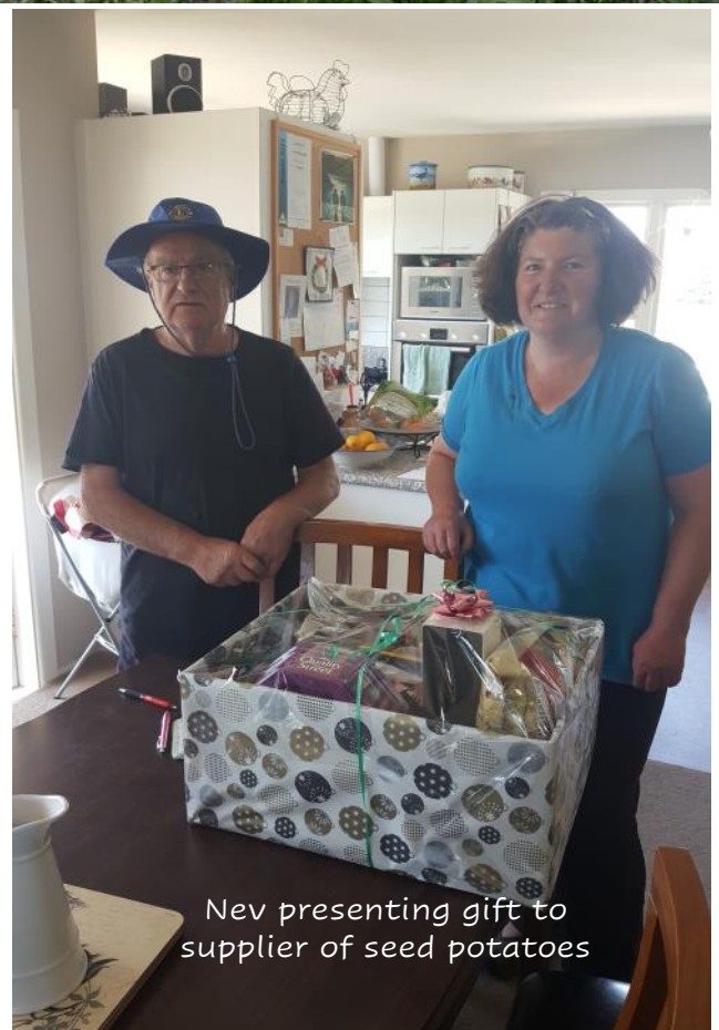
Nev presenting gift to supplier of seed potatoes