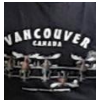
Who owns this? Answer on last page