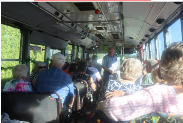
Waipara Springs Winery Christmas Meal