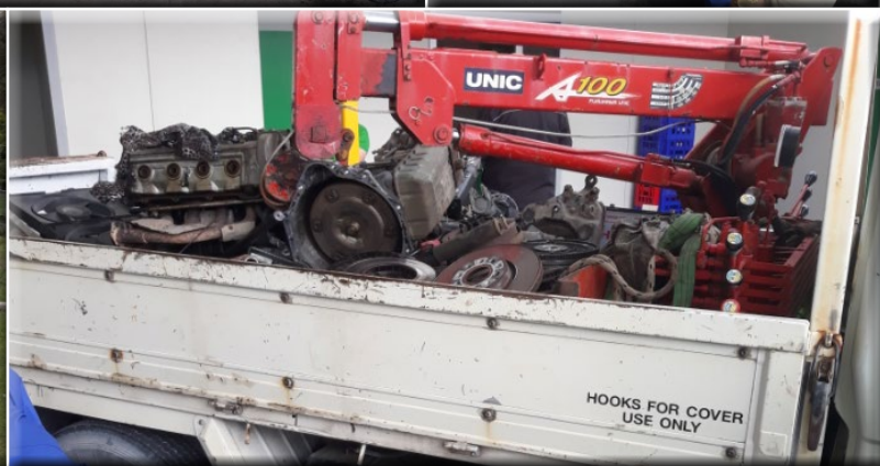
HOOKS FOR COVER USE ONLY