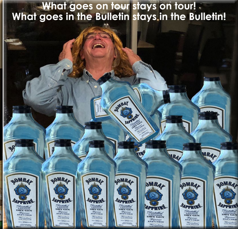
What goes on tour stays on tour! What goes in the Bulletin stays in the Bulletin!